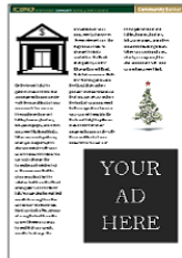
Square 4 7/8" w x 4 7/8" h