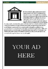
Horizontal 7 1/2" w x 4 7/8" h