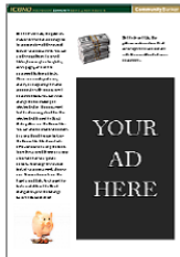
Vertical 4 7/8" w x 6 3/4" h