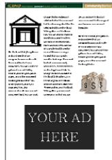
Horizontal 4 7/8" w x 3" h